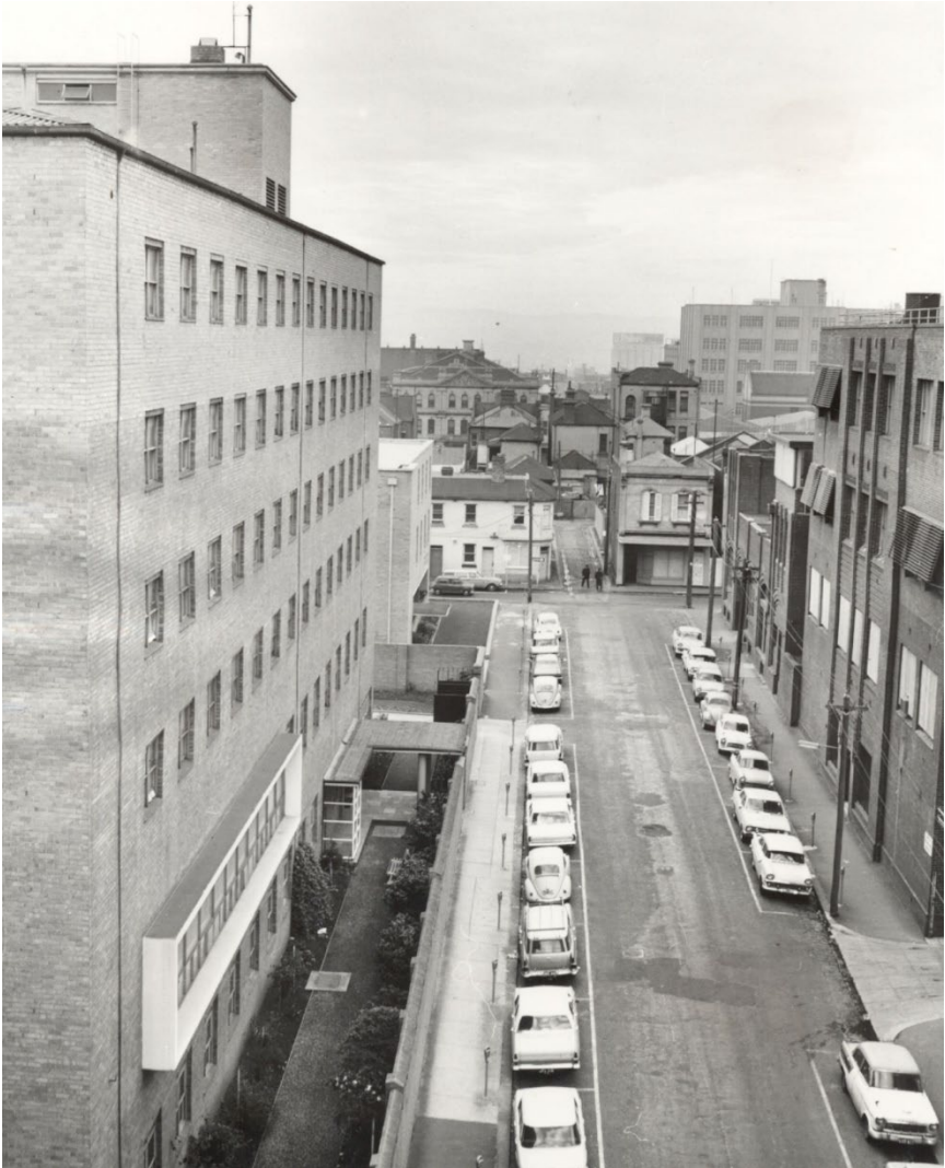
Looking eastward down Princes Street towards the Devonshire Arms building circa 1970s.

Brochure content: cited service managers; design SVHM Communications 2024.